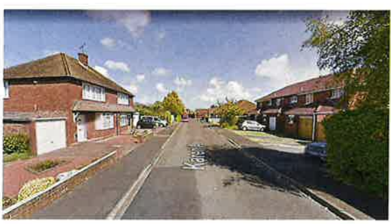
01 Looking East along Karen Avenue