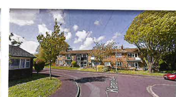
04 Continuing North along Karen Avenue