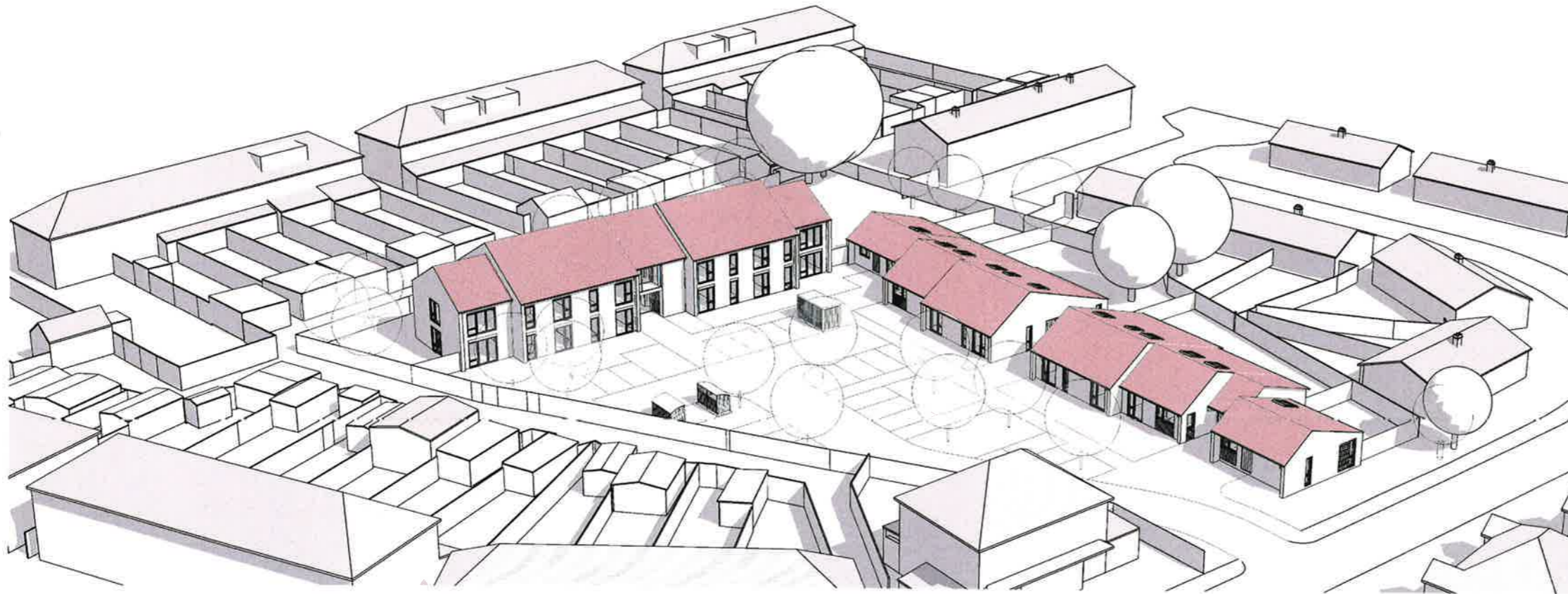
Birds Eye View | Looking North East

NOTE All dimensions to be checked on site prior to commencement of any work ***DO NOT SCALE FROM THIS DRAWING*** Notify C.A of any discrepancies before ordering materials. © Crown Copyright and database right Ordnance Survey Licence number 100019671 (2015)