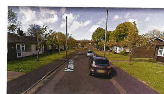
03 Looking North along Karen Avenue