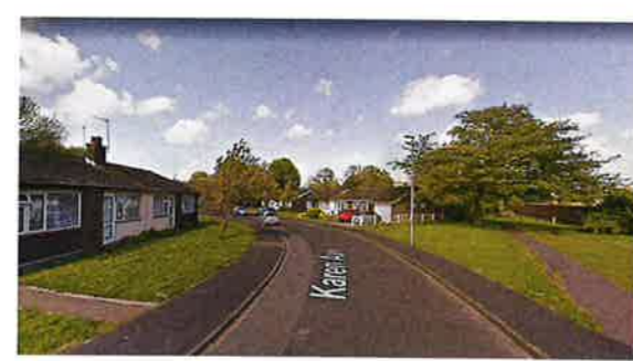
02 Looking North East along Karen Avenue