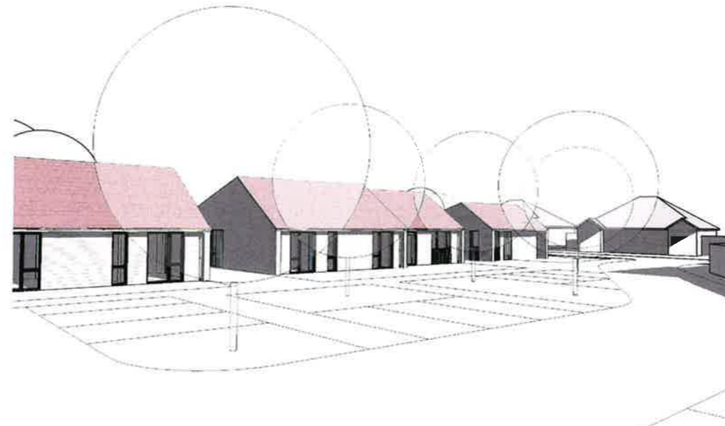
View towards Karen Avenue | Looking South East